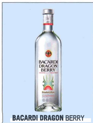
BACARDI DRAGON BERRY