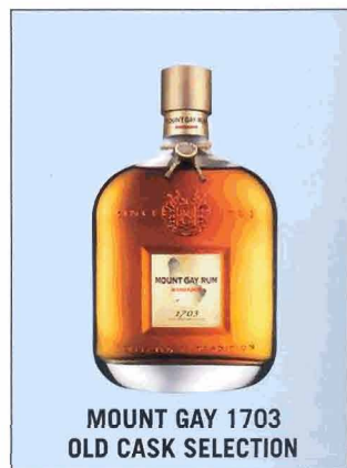
MOUNT GAY 1703 OLD CASK SELECTION